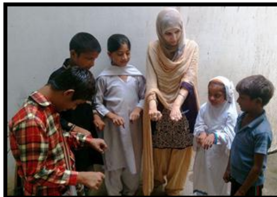
MUSCLE MOVEMENT PRACTICE